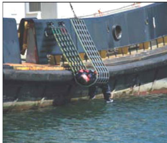
Operating the Jason's Cradle with high freeboard vessels is no problem using a block and tackle or davit crane system

The Jason's Cradle is available in virtually any practical width and length and in different configurations including stretcher and scramble-net variants to suit the requirements of owners and operators in every marine sector.